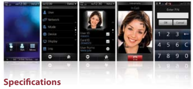
Intuitive Touchscreen GUI of BioStation T2